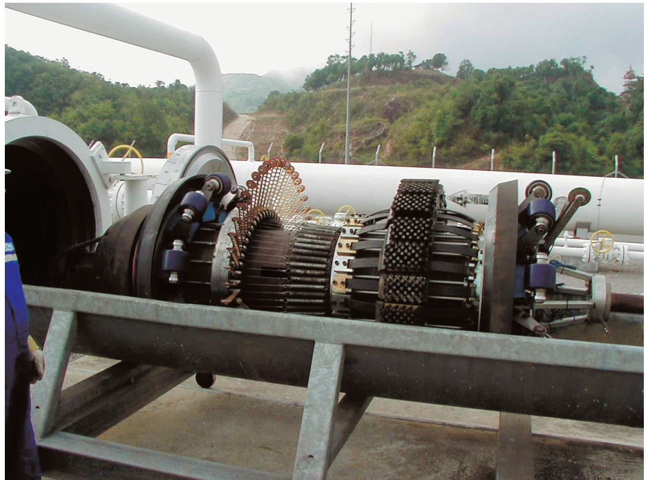
Insertion of the „Pig“